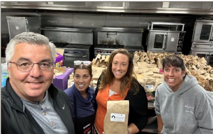
Parishioners gathered for the Sack Meals Project on October 31.