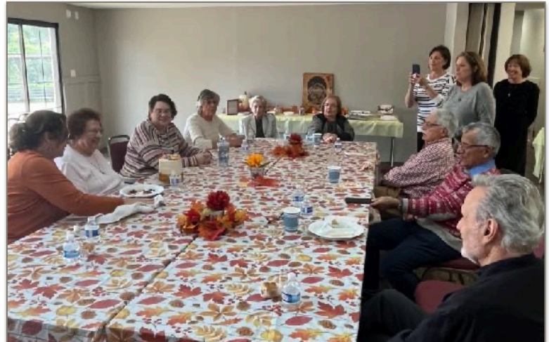
November 9th VIPs luncheon