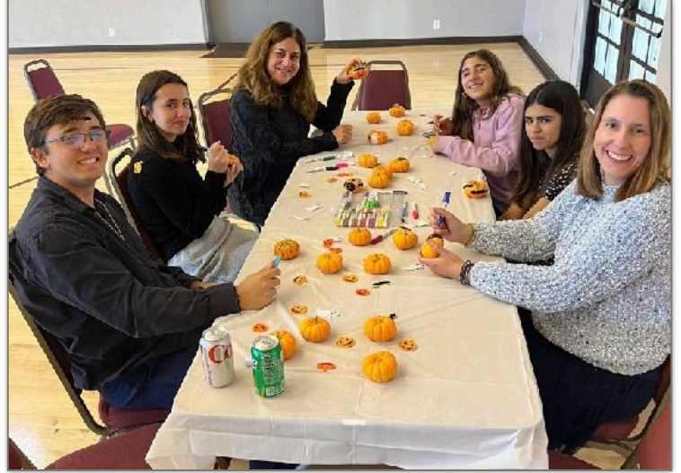
Trunk or Treat Family Day