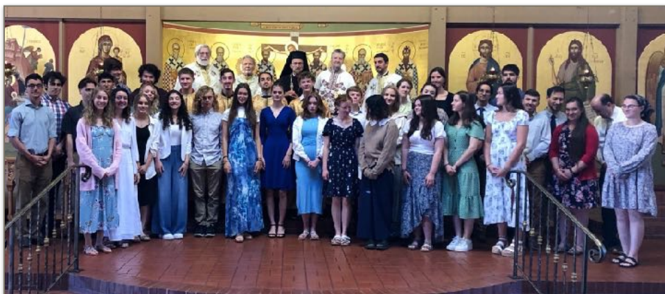
Participants of the Bay Area CrossRoad Program