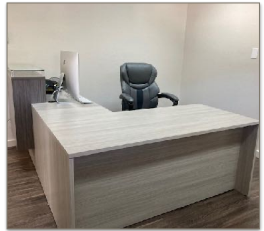
REBEKAH'S NEW OFFICE DESK

The kitchen ceiling and cabinets have been installed as part of our Facilities Improvement .