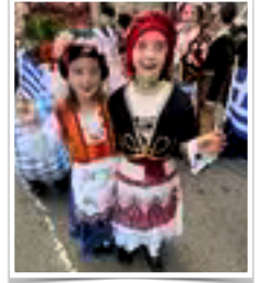
SF Greek Independence Day Parade with Evzones from Greece